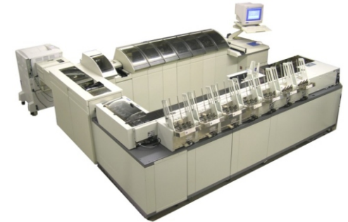
9000 Complete Systems

A wide variety of used equipment is available including embossers, tippers, encoders, inserters, imprinters, thermal printers, card counters and much more.