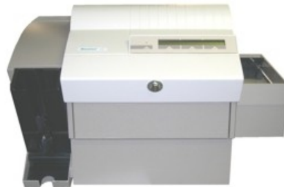
Datacard 280 Embosser